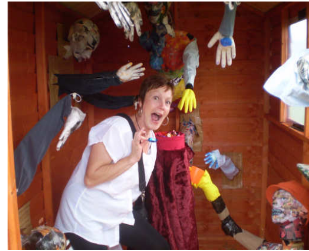
The Scary Shed - June '09