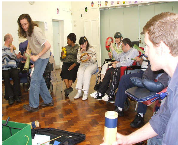
Musiking - September '09