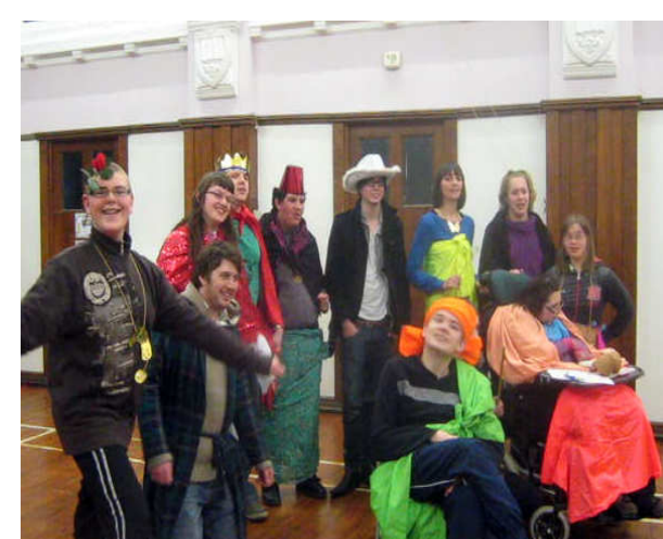
Instant panto! - January '10