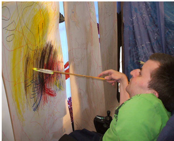
Just painting - Summer '09