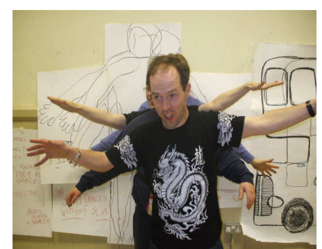
Dance the Jitterbug! - March '10

Pyramid of Arts People October 2008 - March 2010