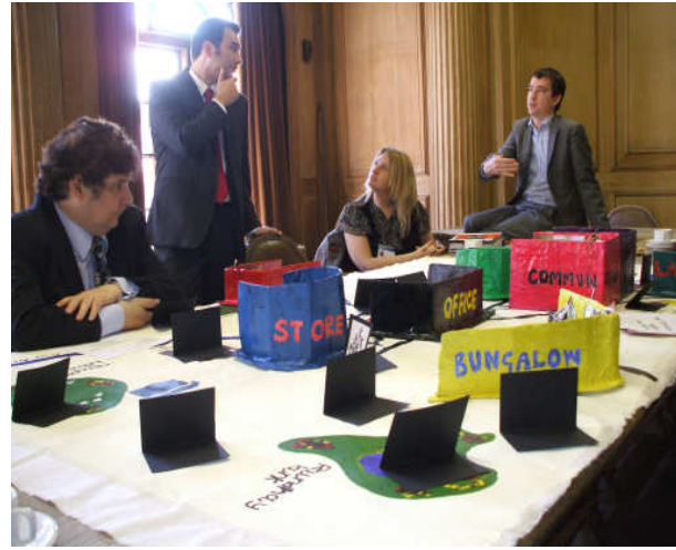
Meeting the city councillors - November '08