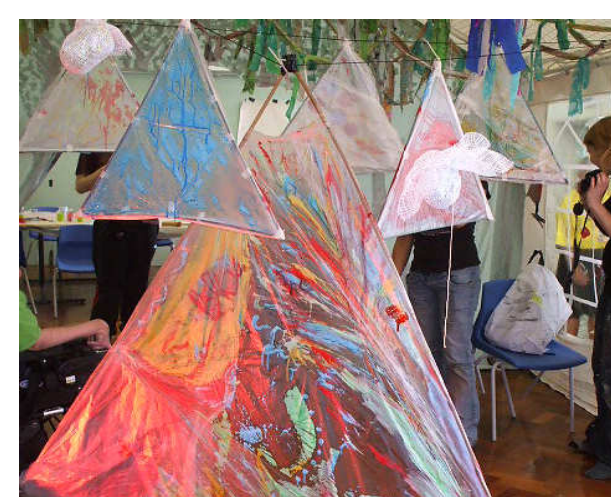
Residency work - Summer '09