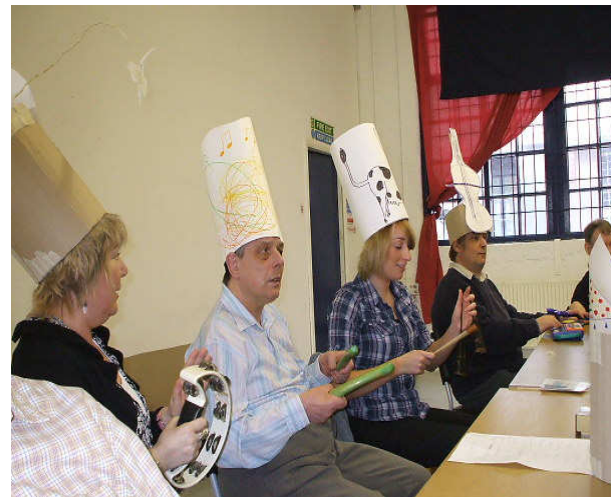
'Where did you get that hat?' - Summer '09