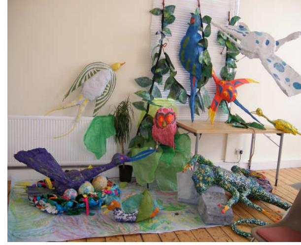
'Lizzie and Friends' - April '09