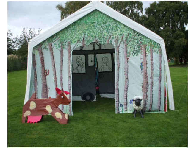
Come for 'A Walk in the Country' - September '09