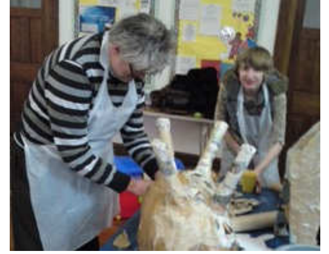
Getting stuck in - March '09