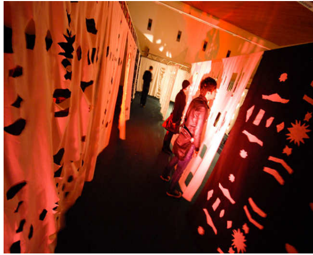
Light Maze installation - October '08